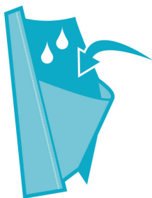
Place penis in the pouch