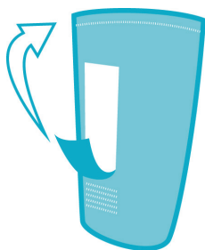
Remove the tejp